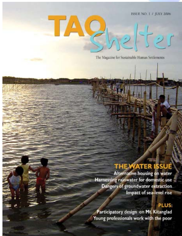
The first issue cover of TAO Shelter

TAO-Pilipinas marks its 5 th anniversary with an initial publication of its Research & Publications (R&P) program, TAO Shelter . TAO was established on August 20, 2001 with the vision of sustainable human settlements that are inclusive, people-centered, environment-friendly and promotes equitable distribution of and access to resources. TAO Shelter is a bi-annual magazine dedicated to promoting this vision. More specifically, the publication aims to: