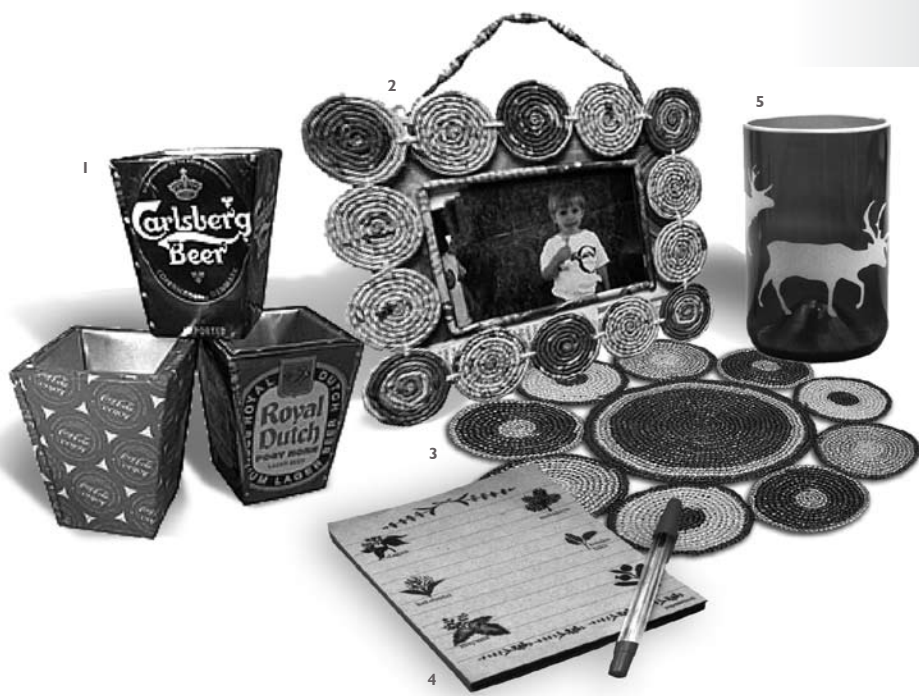
1. DISCARDED BEER CANS MAKE COOL PENCIL HOLDERS. SEE MORE IN WWW.3RLIVING.COM . 2. PICTURE FRAME FROM COILED NEWSPRINT MADE BY THE WOMEN'S MULTIPURPOSE COOPERATIVE IN BAGUIO CITY, PHILIPPINES. SOLD IN WWW.TENTHOUSANDVILLAGES.COM . 3. PLACEMAT CROCHETED FROM COLORED PLASTIC BAGS BY QUI DIT MIEUX IN BENIN, WEST AFRICA. SOLD IN WWW.TENTHOUSANDVILLAGES.COM . 4. NOTEPAD MADE FROM 100 PERCENT RECYCLED KRAFT PAPER BY PAMELROTI IN THE PHILIPPINES. SEE MORE IN WWW.PAMELROTI.COM . 5. DRINKING GLASS MADE FROM A LIQUOR BOTTLE BY THE YELLOWKNIFE GLASS RECYCLERS COOPERATIVE IN YELLOWKNIFE, CANADA. RECOMMENDED BY WWW.GREATGREENGOODS.COM . 6. BRIGHTLY-COLORED BELT MADE FROM WOVEN CANDY WRAPPERS BY ECOIST. SEE MORE IN WWW.ECOIST.COM . 7. USED JUICE PACKS MADE INTO SLIPPERS BY THE KILUS MULTIPURPOSE ENVIRONMENTAL COOPERATIVE IN PASIG, PHILIPPINES. MORE FROM WWW.KILUS.ORG OR WWW.BAZURASHOP.COM .