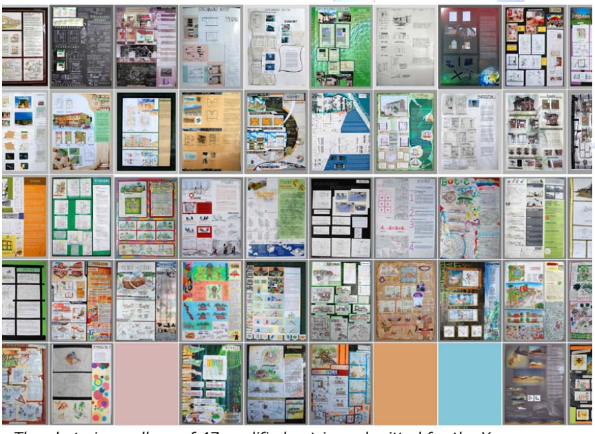
The photo is a collage of 47 qualified entries submitted for the Young Professionals Design Challenge organized by TAO-Pilipinas.

TAO-Pilipinas Young Professionals Program