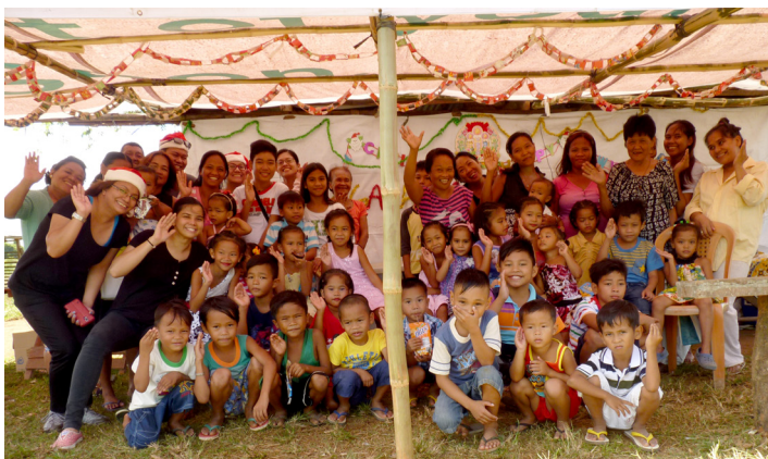
TAO staff and volunteers pose with the children of Masagana community along with their parents after the gift giving activity.

TAO-PILIPINAS CONTINUED ITS yearly endeavour of bringing holiday cheer to children in the communities where the organization currently has projects. Last December, friends of TAO-Pilipinas once again gave their donations to support the Christmas gift-giving activity for children. With their donations, 200 gift packs were assembled; 140 were sent to Manicani Island in Guiuan