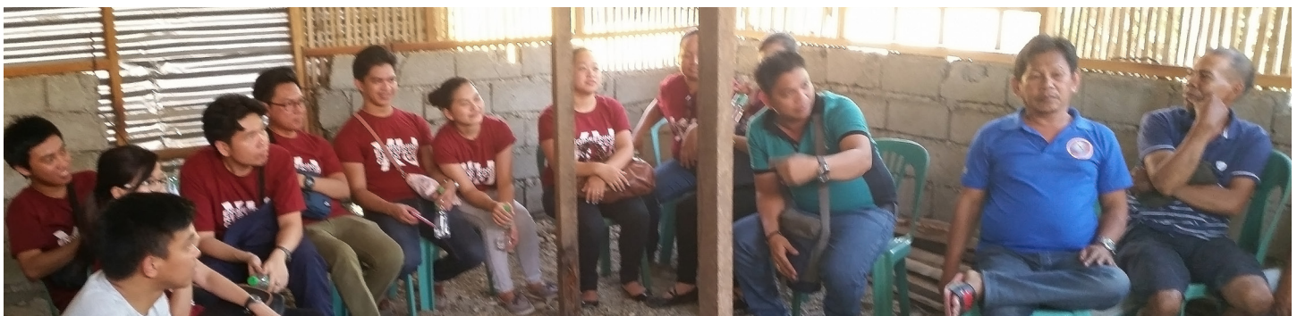
Representatives from Xavier University listen to the community leaders of Gusa Hillside United Neighborhood Association, Inc. (GHUNAI) during the site visit in Brgy. Gusa.

The upcoming 2016 YP Workshop on Social Housing is hoped to set off design professionals in Cagayan de Oro City to be more involved in providing technical assistance to urban poor communities in their city. (AMPS)