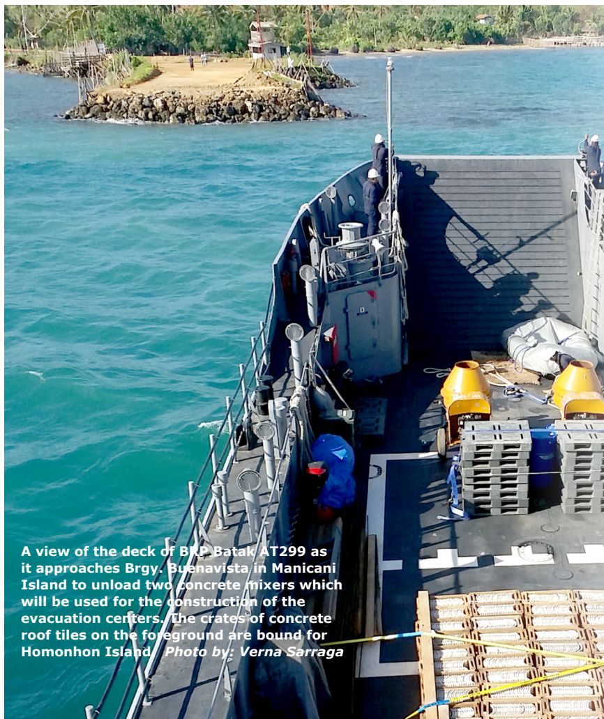
A view of the deck of BRP Batak AT299 as it approaches Brgy. Buenavista in Manicani Island to unload two concrete mixers which will be used for the construction of the evacuation centers. The crates of concrete roof tiles on the foreground are bound for Homonhon Island.