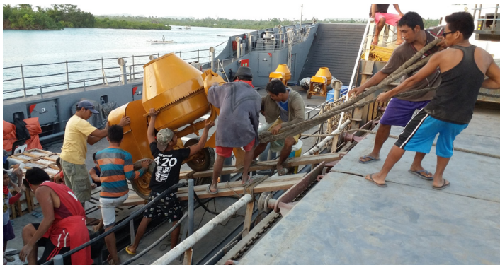
Porters haul the cement mixer through a makeshift ramp.

Project Pagbangon is a post-disaster rehabilitation initiative of Philippine Misereor Partnership Inc. (PMPI) in the islands of Manicani and Homonhon. Last December 2015, the shelter assistance for Manicani Island came into full circle and 40 concrete houses on safer areas were built. The project is now gearing towards the construction of 4 evacuation centers in Manicani, plus 80 houses and 8 evacuation centers in Homonhon.