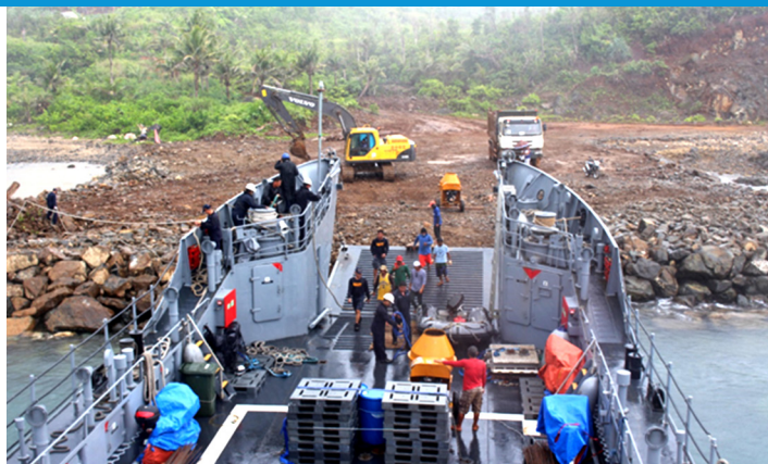
Unloading of the remaining construction materials and equipment in Homonhon.